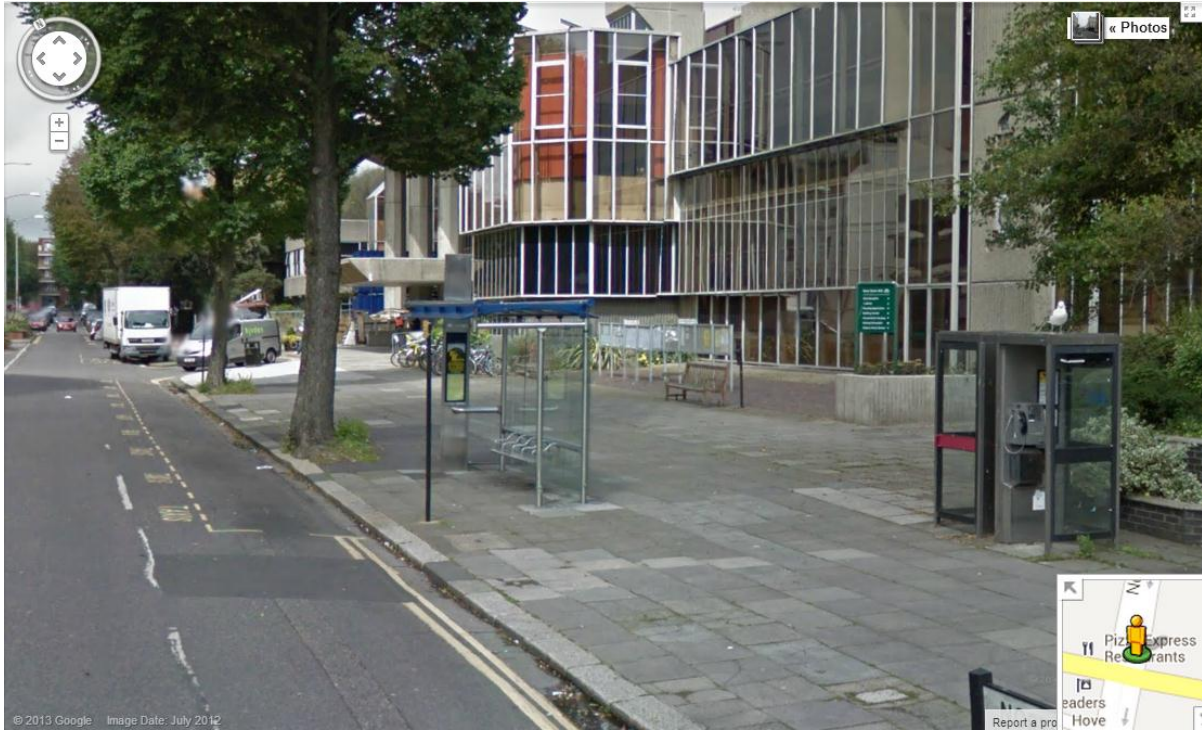
Existing Hove Town Hall pavement frontage along Norton Road