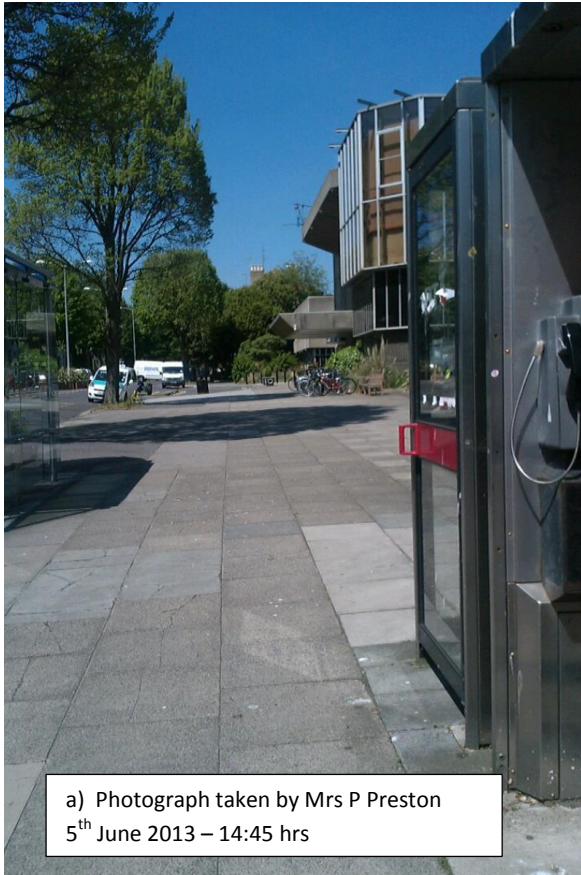
a) Photograph taken by Mrs P Preston 5 th June 2013 – 14:45 hrs